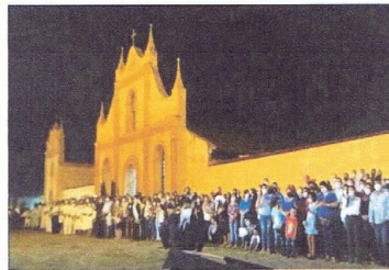
San José de Chiquitos. Holy Week. 2021