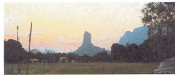
Chochis, where we have a Marian Shrine recalling her intercession to save the local town and rail passengers during massive avalanches in January of 1979.