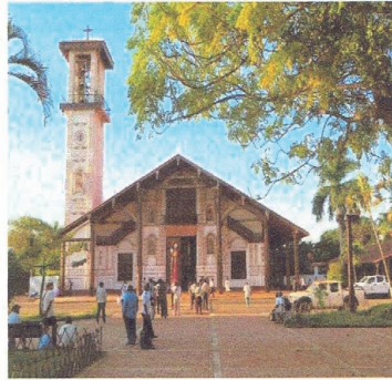
Cathedral of San Ignacio. Rebuilt in 2000 according to the original 1761 Jesuit church, conserving the 1967 intermediate cathedral bell tower which is presently being re-modeled to harmonize with the rest of the Cathedral.

(Please make checks payable to your local parish)